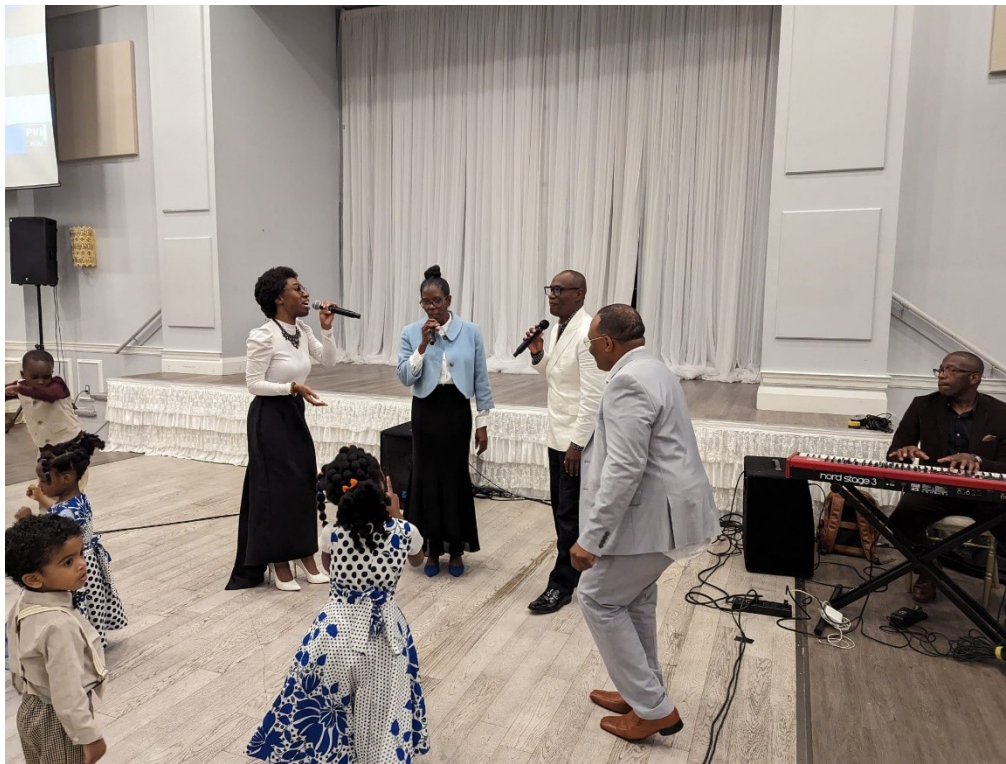
They are singing, dancing, and having a good time