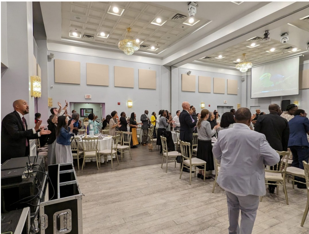
Here, the People are Singing and Praising God