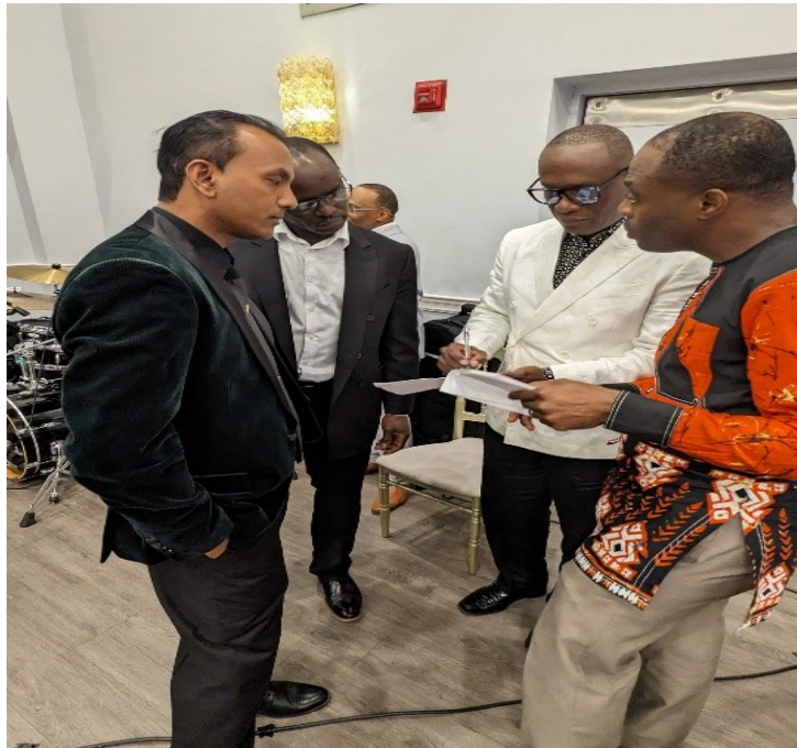
Perfect Love Tabernacle Deacons is discussing the progress of the celebration event.